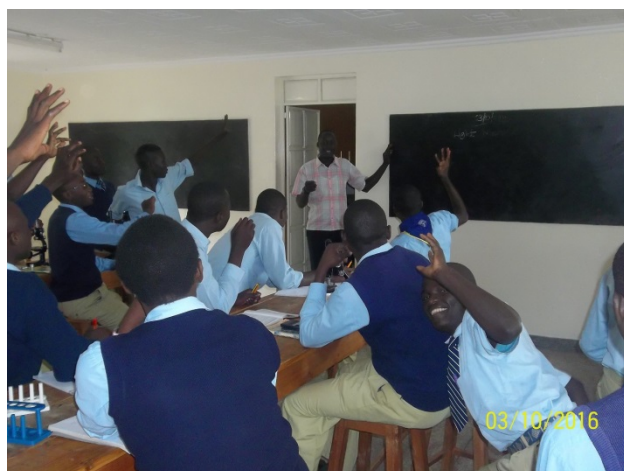
Classroom in Science Building

Just a reminder to please send your Christmas gifts very soon. The students will leave in mid-November and it takes three weeks for the packages to get there. A watch, battery operated alarm clock, socks, handkerchiefs, anything small will be a grand gift. Thank you for caring for your students and brightening their days. If you want to send a letter of encouragement as they begin their end of term tests, please do so quickly. The freshmen will be beginning their tests next week.