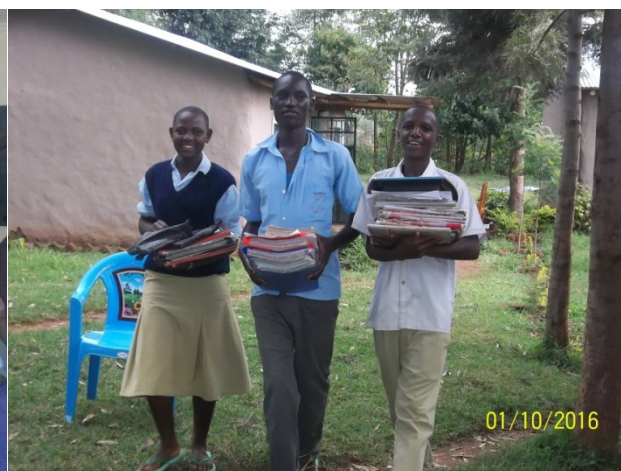
Moving books into the Science Building