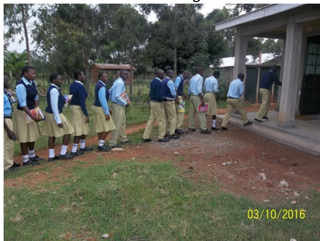
The first students to enter new building