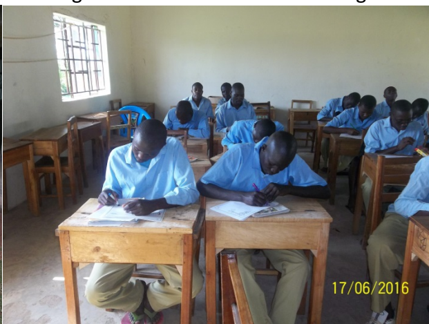
Students at work on their science studies

We are thanking our Savior for His protection, wisdom, and strength. We pray that we can always be a light in the darkness and acknowledge Him as our leader and ruler. Amen.